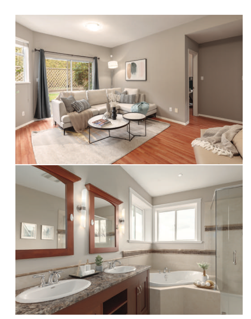
Open concept floorplan, generously sized rooms, and double sink vanity, and nuheat flooring to ensure optimal comfort.